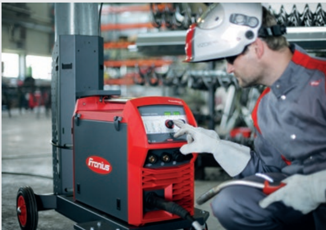
/ Very easy to operate, digitally controlled, with 'on-board' expert knowledge