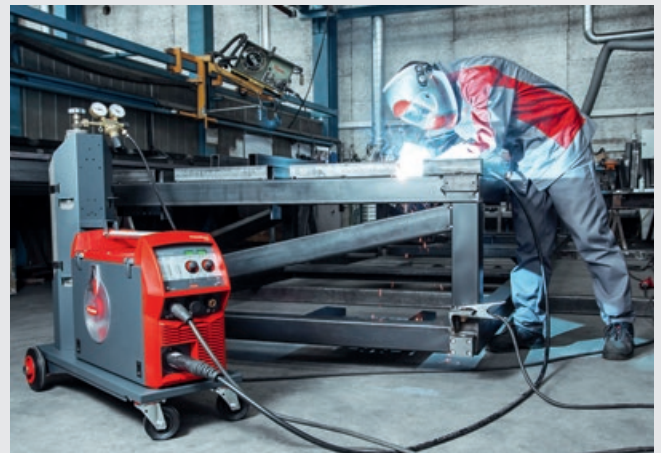
/ TransSteel 2500 Compact – the space-saving, powerful alternative for workshop operations